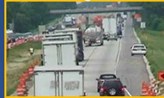
Police lights off