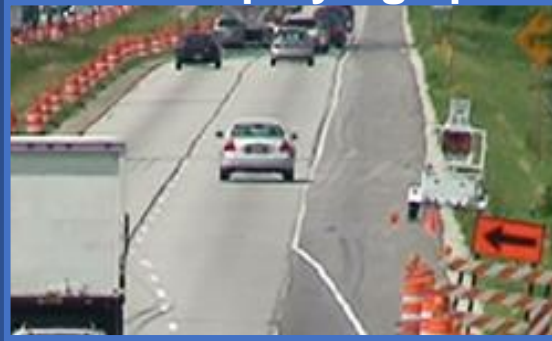
Trailer displaying speed